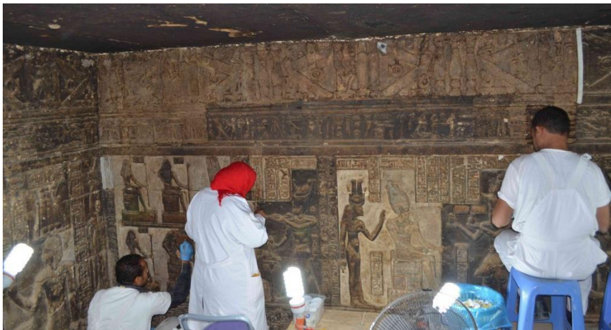
Conservation trainees cleaning blackened walls at Deir el Shelwit Temple

Strengthening Egyptian-American relations through scholarly research, preservation, and conservation